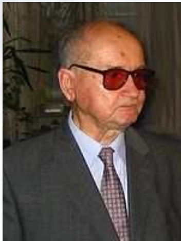
Wojciech Witold Jaruzelski

1989 semi-free elections with Solidarity Sejm: 1/3-2/3 Senate: 99/100 President: Jaruzelski (-1990: Wałęsa) Prime Minister: Mazowiecki