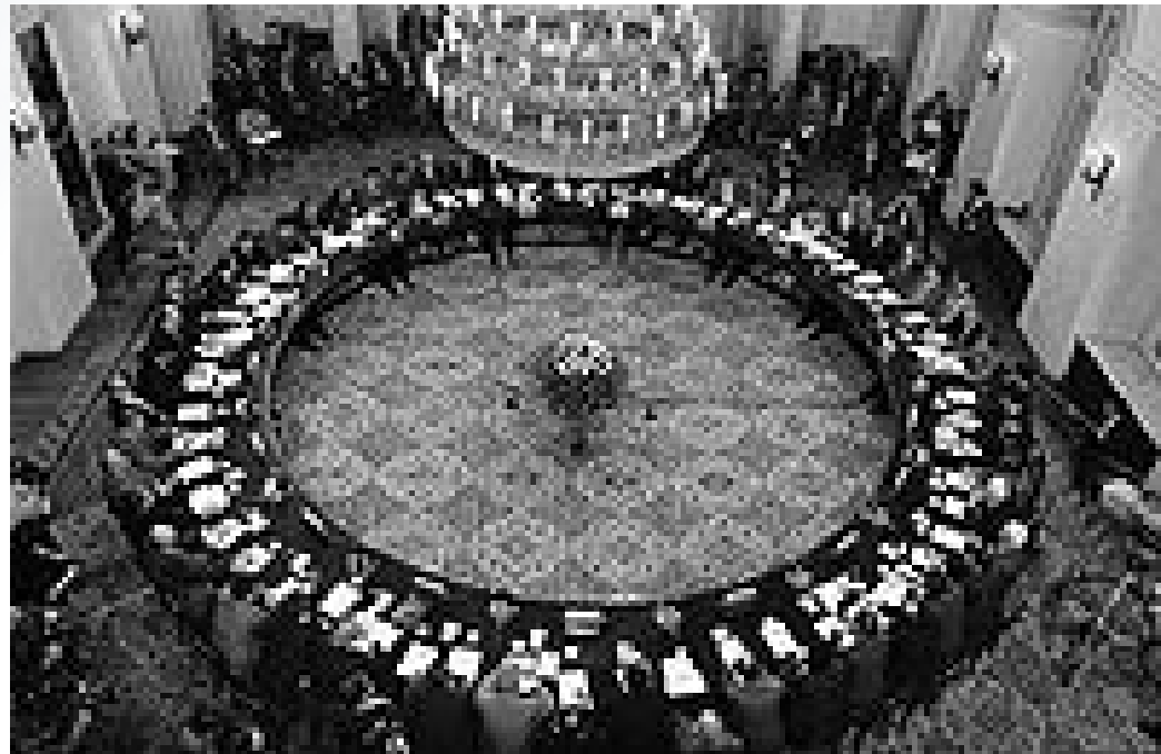
Bicameral legislature President