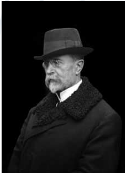
Tomáš Garrigue Masaryk

http://en.wikipedia.org/wiki/Czech_Socialist_Republic